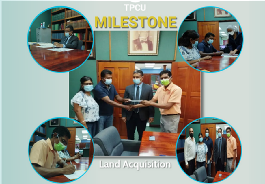
Land acquisition for New Building –22/08/2022

On Monday 22nd August 2022, TPCU acquired the land situated at Lot No. 3 Penal Rock Road, Penal, on which our new building will be constructed. This is a major accomplishment and another step in achieving our future goals! Congratulations to our members!